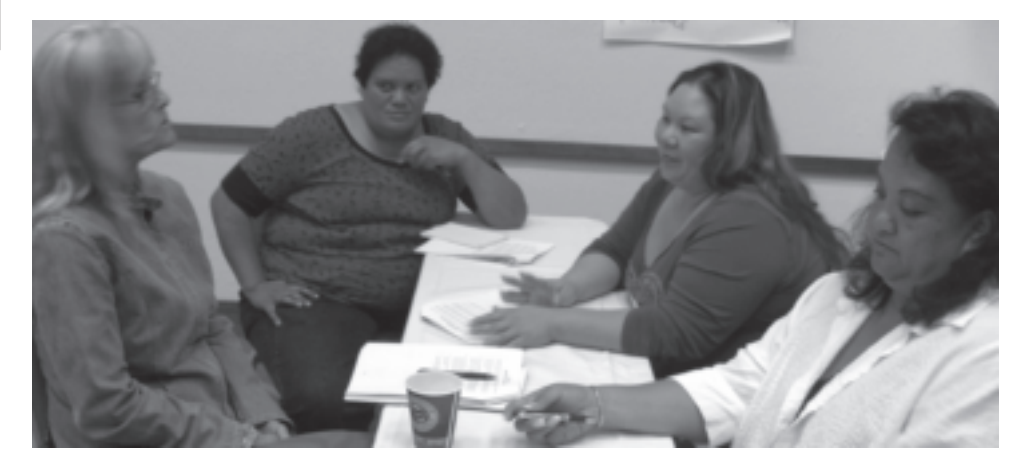
Hawaii Division stewards discuss how they would defend a member in a discipline case.