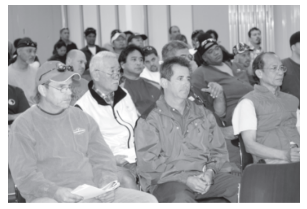
Young Brothers Ltd. Honolulu port members listen carefully to a report on their tentative agreement before voting overwhelming to accept the settlement on February 27, 2009.