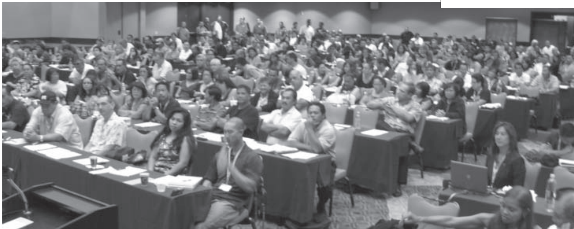
Over 360 ILWU Local 142 members met in Convention from September 15-18, 2009, to make policy, approve programs, and set the direction of the union for the next three years. All actions of the Convention must be reported to the membership and approved by a majority vote.