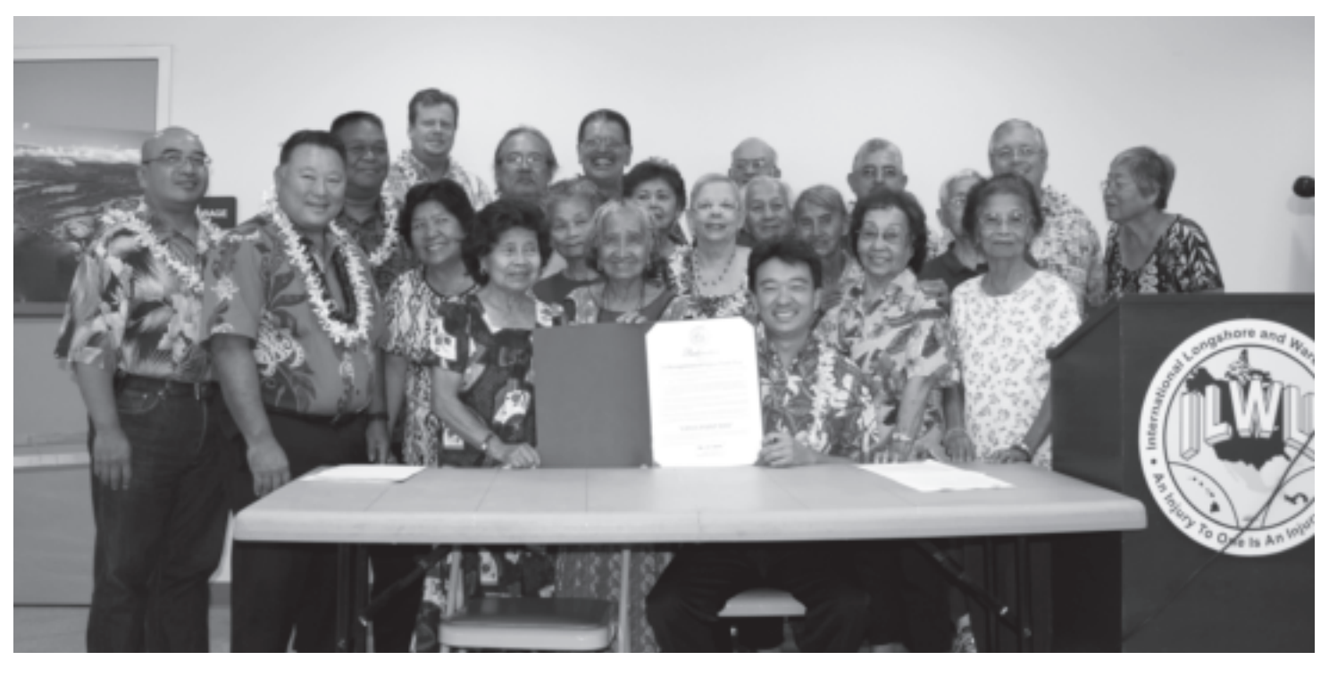
Some of the 1,600 ML&P pensioners who no longer have to worry about receiving full pension benefits, with elected officials, ILWU members and leaders, and (seated) acting Governor Tsutsui, who displays the "Lipoa Point Day" proclamation signed on October 9, 2014.

In spite of restructuring, by the end of September 2013 ML&P had unfunded pension liabilities of $24.2 million. This funding shortfall caused the Pension Benefit Guarantee Corporation (PBGC) to become involved in overseeing ML&P's pension plan. The PBGC is a federal