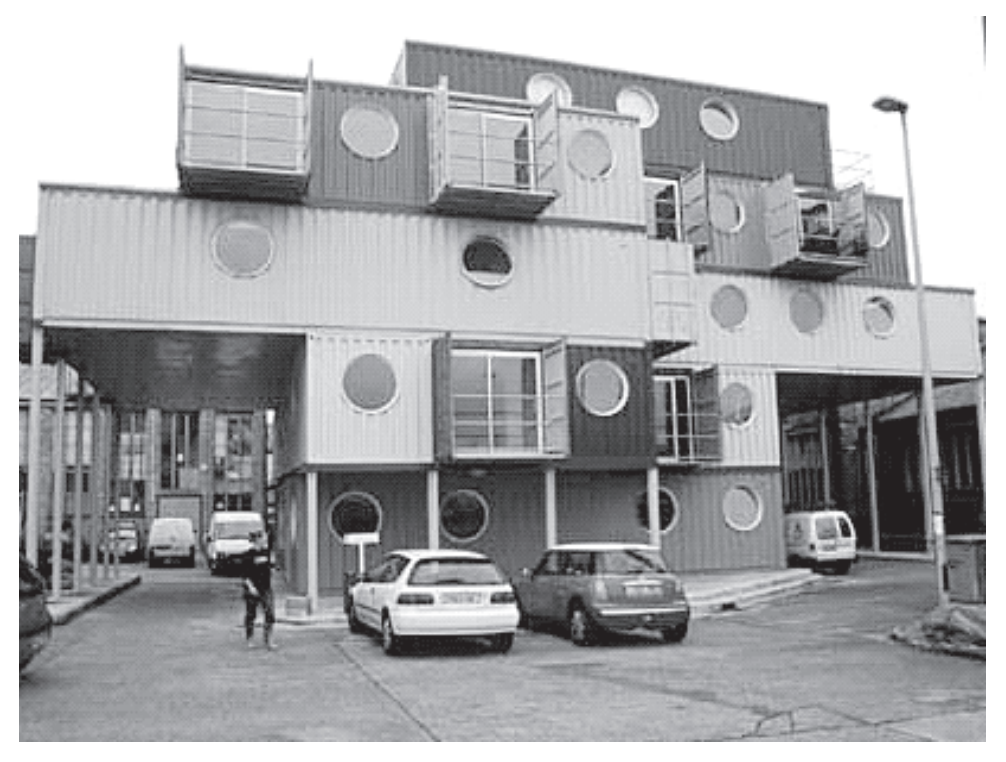
Container City on Trinity Buoy Wharf in London used 45 containers to create 34 studio apartments.

Containers are designed to be easily transported by railcars, trucks, and ships. Energistx, a US company, takes advantage of this to create container-shelters which can be quickly moved and used in a disaster area or construction site. Some of their models made from 40 foot containers are: a 6-person bunkhouse with kitchen and bath; a 30-person dormitory with 10 triple bunk beds (no bath); and a