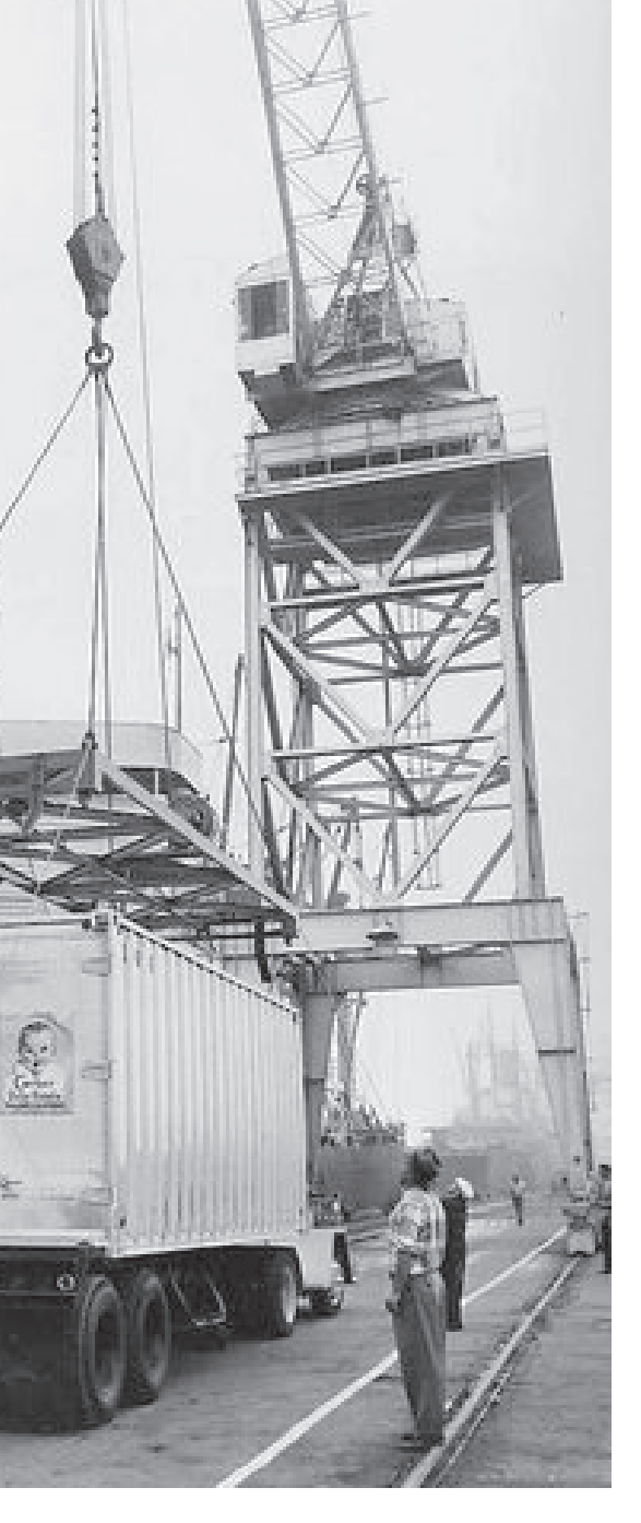
vaii contained a load of Gerber baby food. ton C-3 freighter modified to carry 20