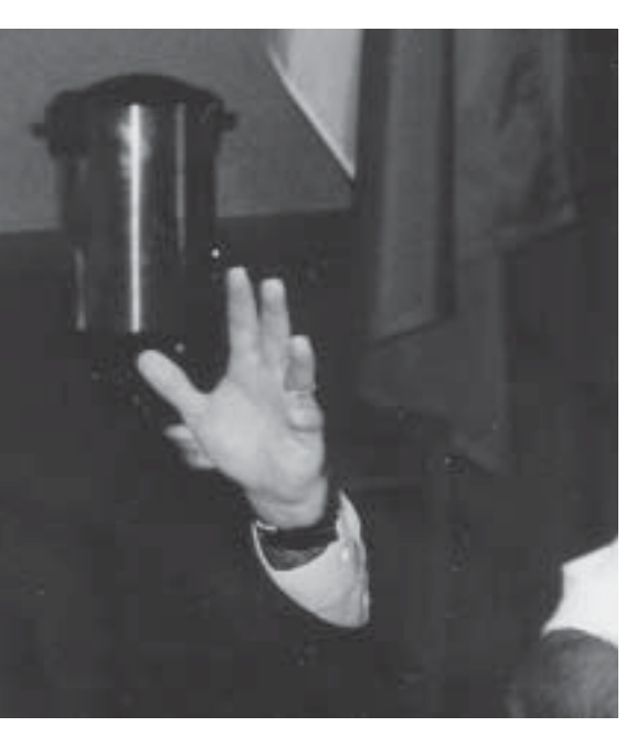
explains how union density, having more

need to see their families aren't secure as long as these gaps exist. A rising tide lifts all boats, but a falling tide pulls everyone towards the drain."