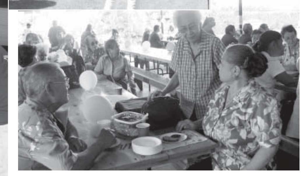
Pensioners make new friends and renew old acquaintances.