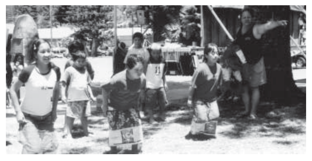
Children's activities included races, games, art activities, and "bouncers."