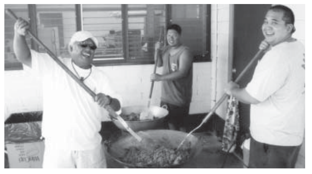
Volunteers cooked gallons of chili and thousands of hotdogs for lunch.