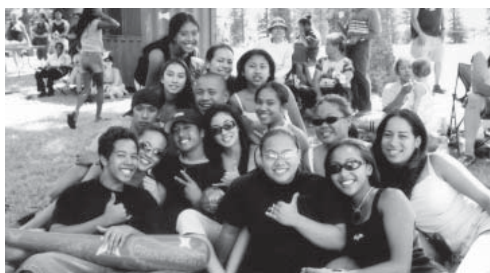
Many teenagers attended the picnic, enjoying a day of reggae music by local Lanai groups "Our Turn" and "Uprise."