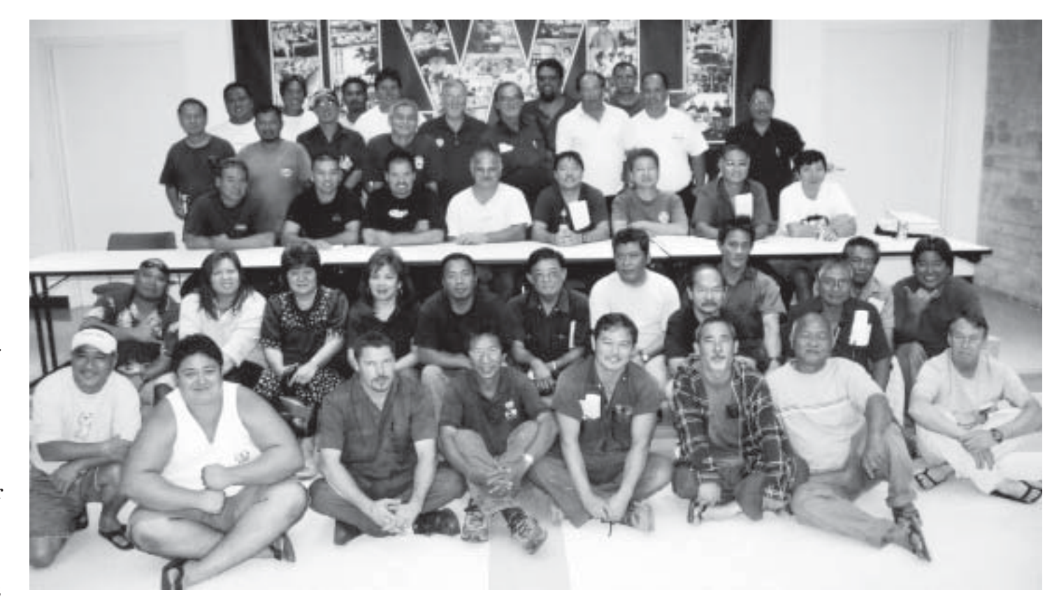
Schuman Carriage ILWU members meet as a unit for the last time to ratify a memorandum of agreement bargained over the effects of the closure of their workplace.

Schuman Carriage will permanently close its business at the end of November 2004. Potential buyers were unable to reach an agreement with Schuman on the sale of their assets. The company is family owned and operated and the family was no longer interested in continuing the business. About 47 members will lose their jobs in the shutdown. •